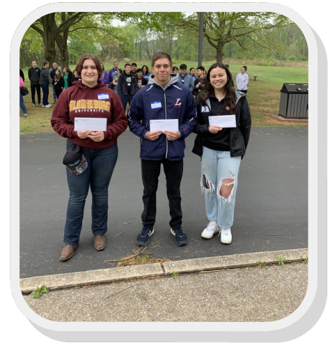
recipients of a 2023 Lebanon County Envirothon Scholarship!

For a seventh year, the Lebanon County Envirothon offered a $1,000 Envirothon Scholarship to graduating seniors participating in the Lebanon County Envirothon.