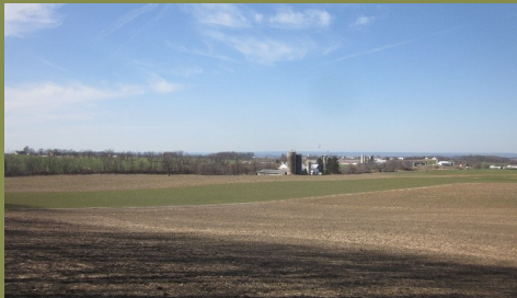
362 acres of prime farmland preserved forever in West Cornwall Twp

Craig Zemitis Agricultural Preservation Specialist 717-277-5275 extension 142 craig.zemitis@lccd.org